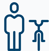
Active Transportation Options